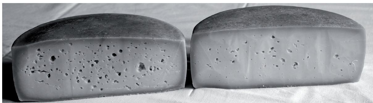
Fig. 2. Cheese wheels matured at different temperature.

In addition, seven new esters were identified only in cheeses ripened in the grape marc (Tab. 3). From these esters, butyl ethanoate was identified